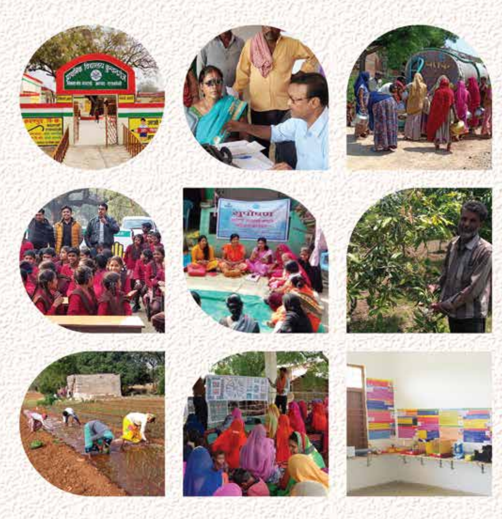
BUILDING A BETTER TOMORROW