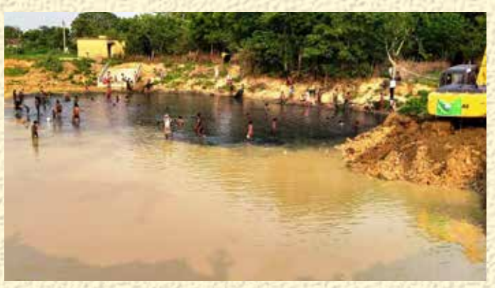
Rain Water Harvesting Pond at Durgapur, West Bengal Durgapur Cement Works: has a well-built infrastructure for rain water harvesting. The harvested water is used for various purposes, including plantation & groundwater recharge.