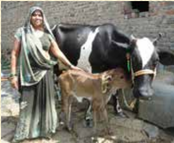
Livelihood & Women Empowerment